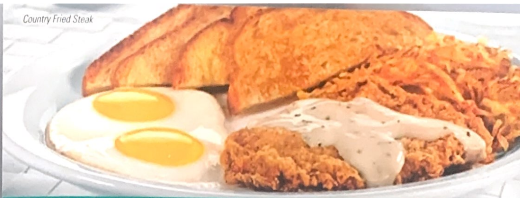
Country Fried Steak