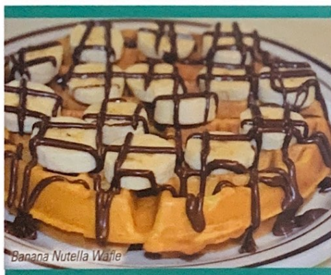
Banana Nutella Waffle

2 pieces of French toast stuffed with creme cheese filling & fruit (strawberry, blueberry or banana) ..... 7.99