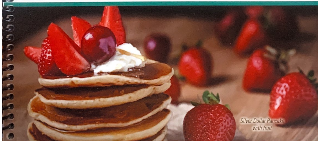
Silver Dollar Pancake with fruit

*Consuming raw or undercooked meats, poultry, shellfish or eggs may increase your risk of foodborne illness.