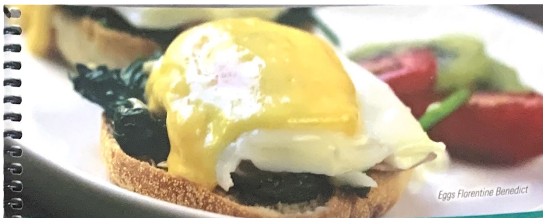
Eggs Florentine Benedict