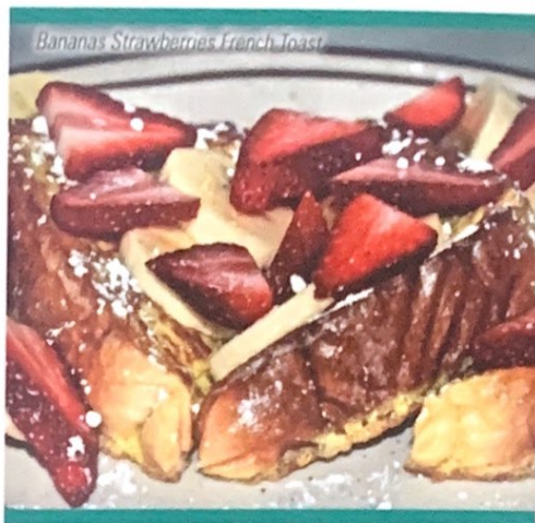
Bananas Strawberries French Toast

Add Bananas, Blueberries, Strawberries or Nutella for 1.50