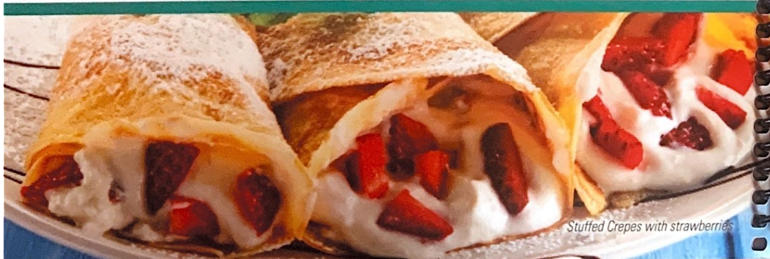
Stuffed Crepes with strawberries

2 pancakes topped with strawberries, bananas and powdered sugar ..... 7.99